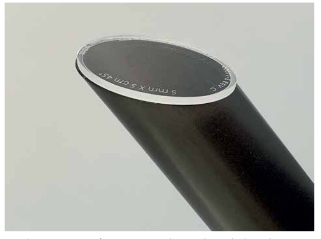
Fig. 2. Picture of tissue-equivalent polymethyl methacrylate (PMMA) bolus attached to IOERT applicator exit to move maximum dose to tissue surface

Surgery was categorized as follows: abdomino-perineal resection (APR), low-anterior resection (LAR), total exenteration (TE, including a resection of the rectum,